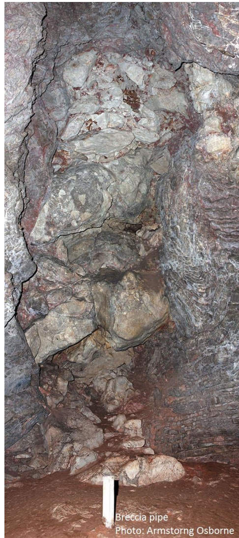
Breccia pipe