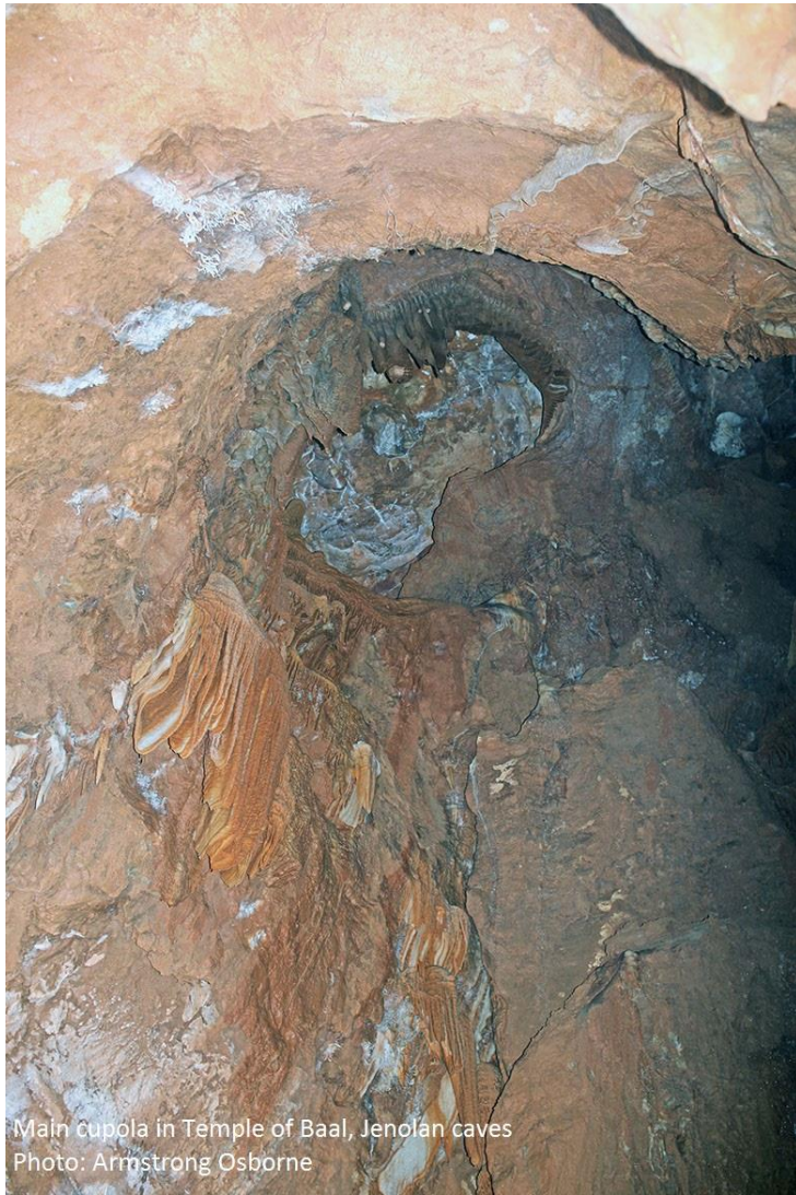
Main cupola in Temple of Baal, Jenolan caves